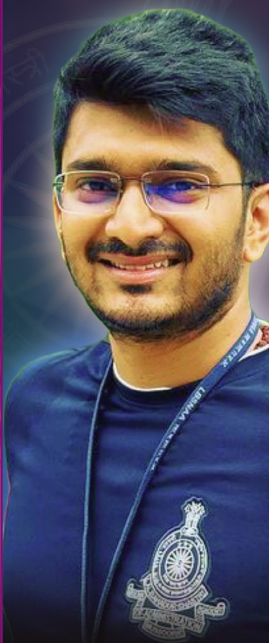
AIR 22 IAS Pavandatta UPSC 2022