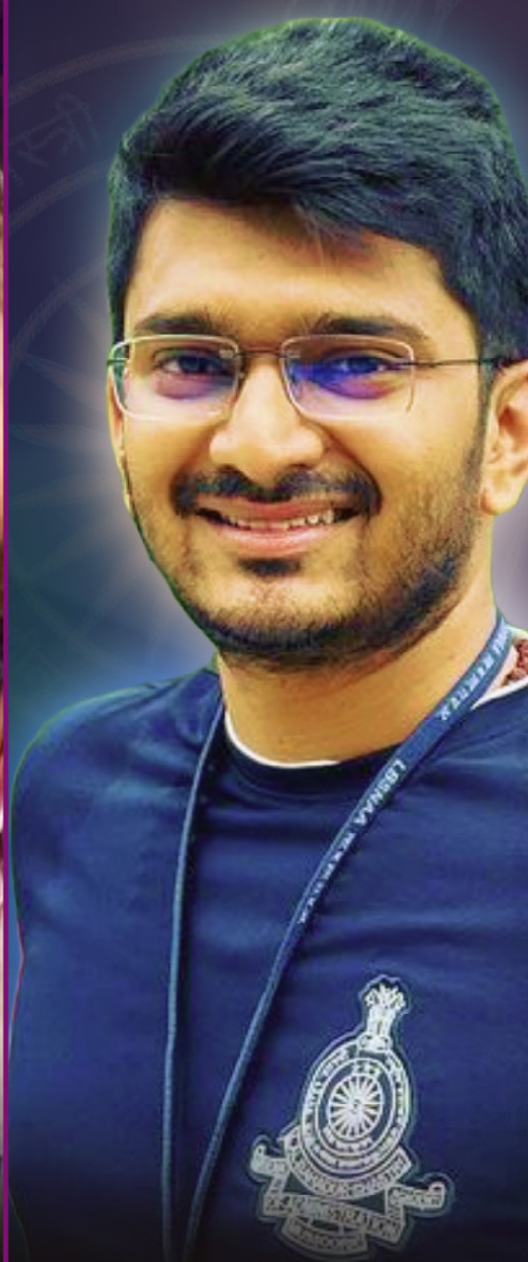
AIR 22 IAS Pavandatta UPSC 2022